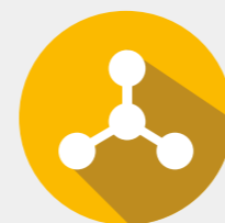
Plastics & Additives