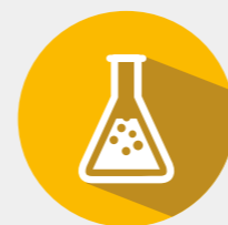
Ligands & Catalysts